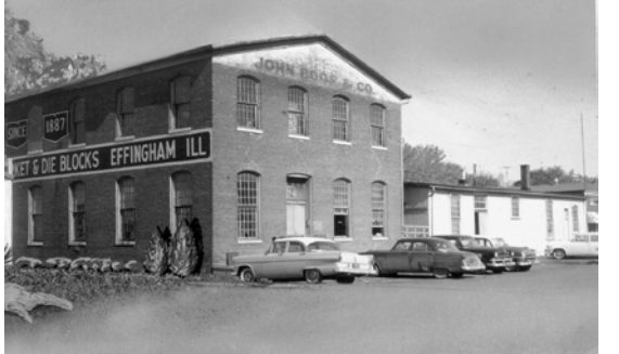
JOHN BOOS & CO. WOOD MANUFACTURING FACILITY EFFINGHAM, IL

In 2017, John Boos & Co. marked the completion of the company's multi year relocation of its corporate and manufacturing facilities from the central Effingham area to the present South Banker Street location. With the completion of the 116,000 square foot, state of the art, wood manufacturing facility, John Boos & Co. will be positioned to continue to provide the best products and service in the markets it serves while allowing for additional new product development, which will continue to stimulate growth.